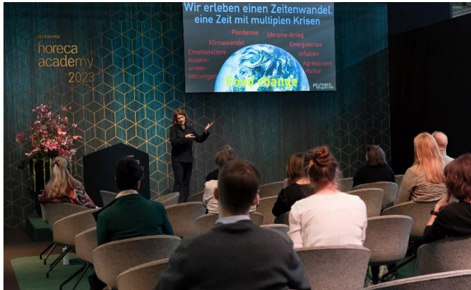
Knowledge exchange at the HoReCa Academy: renowned experts from the industry shared their valuable expertise and encouraged discussion.

Frankfurt's role as the industry centre and global marketplace for the hospitality segment: "We have really missed the big Ambiente in the last three years. It was always the meeting place of the year on a global level. It was the opportunity to make personal contacts again, to present the new products and to explain the new brand strategy. Almost all our existing distributors came: I saw customers from Asia, from Africa, from North America and of course from Europe. As far as hospitality is concerned, Frankfurt's location in the middle of Germany is very important for customers."